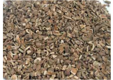
Wu Jia Pi