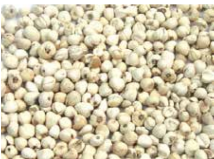
Chuan Bei Mu