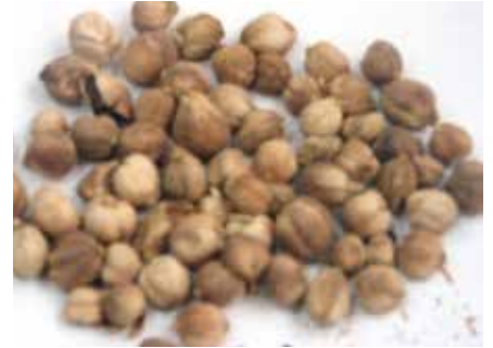
Bai Dou Kou