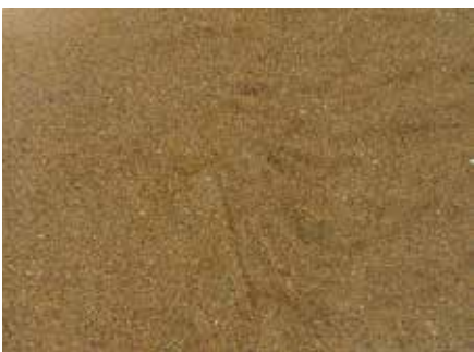
Che Qian Zi