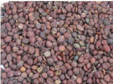
Suan Zao Ren