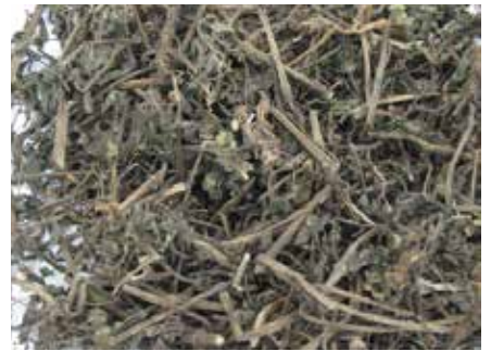
Han Lian Cao