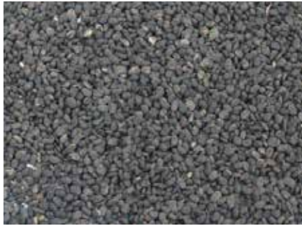
Bu Gu Zhi