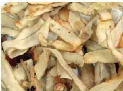
Tian Men Dong