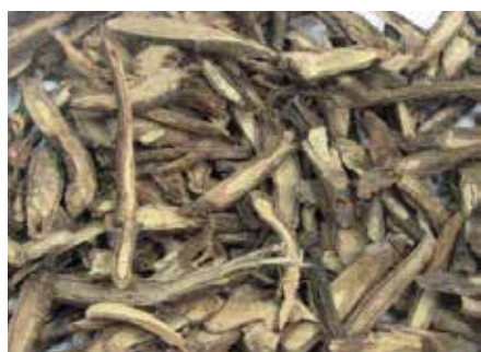
Shan Dou Gen