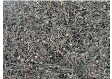
Bai Hua She She Cao