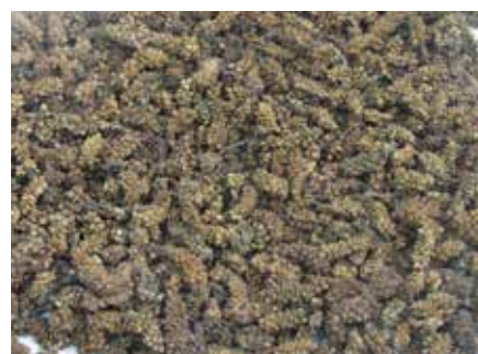
Sang Shen Zi