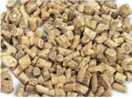
Bei Sha Shen