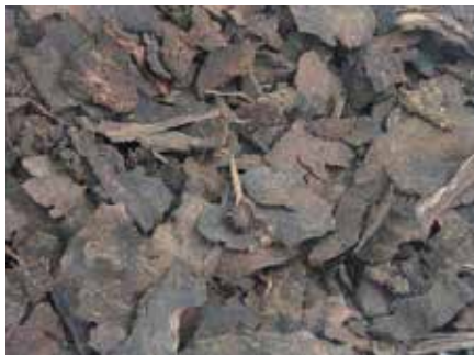
He Shou Wu