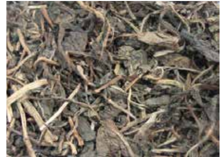
Da Qing Ye