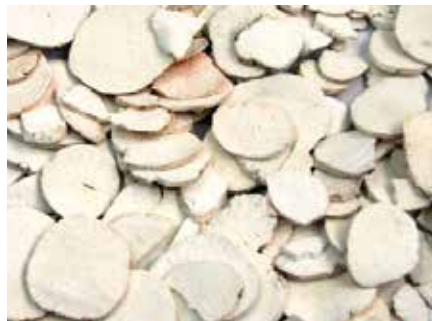
Tian Hua Fen